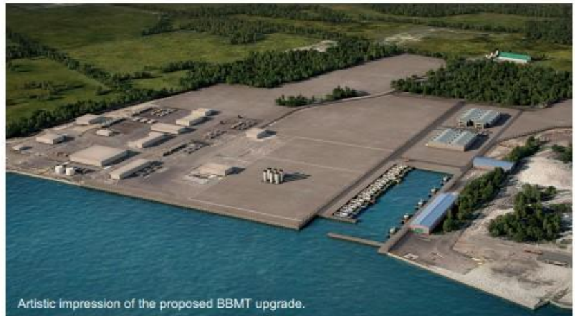
Artistic impression of the proposed BBMT upgrade.

As part of our community consultation process, we will be holding information sessions where community members can drop in and speak to our team.